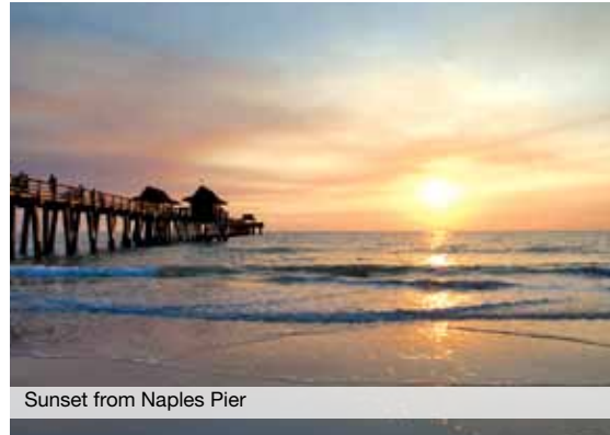
Sunset from Naples Pier

Budget-friendly group values are available year 'round at an array of the area's group properties. And they're easy to find, too. Be sure to visit Paradisecoast.com/meetings to find an updated listing of special offers and group incentives.