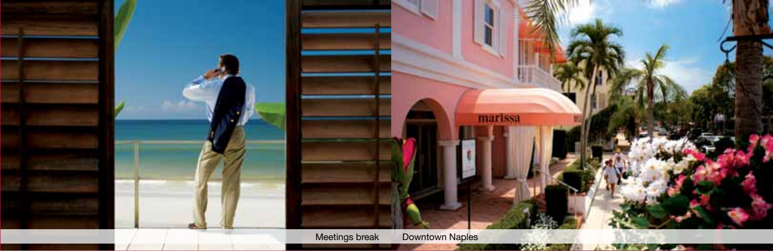
Meetings break Downtown Naples

Meetings in paradise – an alluring combination of spectacular Gulf beaches, a sophisticated vibe with a spotlight on value and mysterious miles of Florida Everglades.