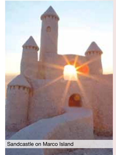
Sandcastle on Marco Island

Spa-themed breaks are a popular component of today's meeting agendas. Consider the first Golden